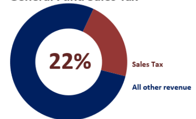
General Fund Sales Tax

The Texas Comptroller's Office posted July 2021 (Fiscal Year 2021, Period 10) collection results on September 9th, 2021. Actual receipts are dependent upon the timeliness and accuracy of sales tax payers' returns. This report provides Fort Worth's sales tax collections, a comparison of collections in the same period last year, and an estimated impact on the current year's budget. The past year has included a change in the method of remitting sales tax to the state comptroller (via legislation), effects of a global pandemic, and effects of a historic winter storm. This activity is being closely monitored and will be highlighted if significant impact is expected.