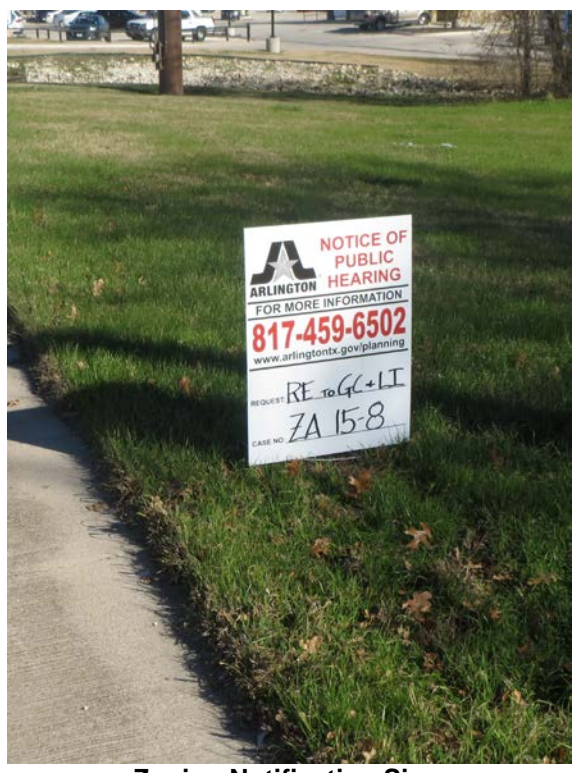
Zoning Notification Sign Arlington, Texas