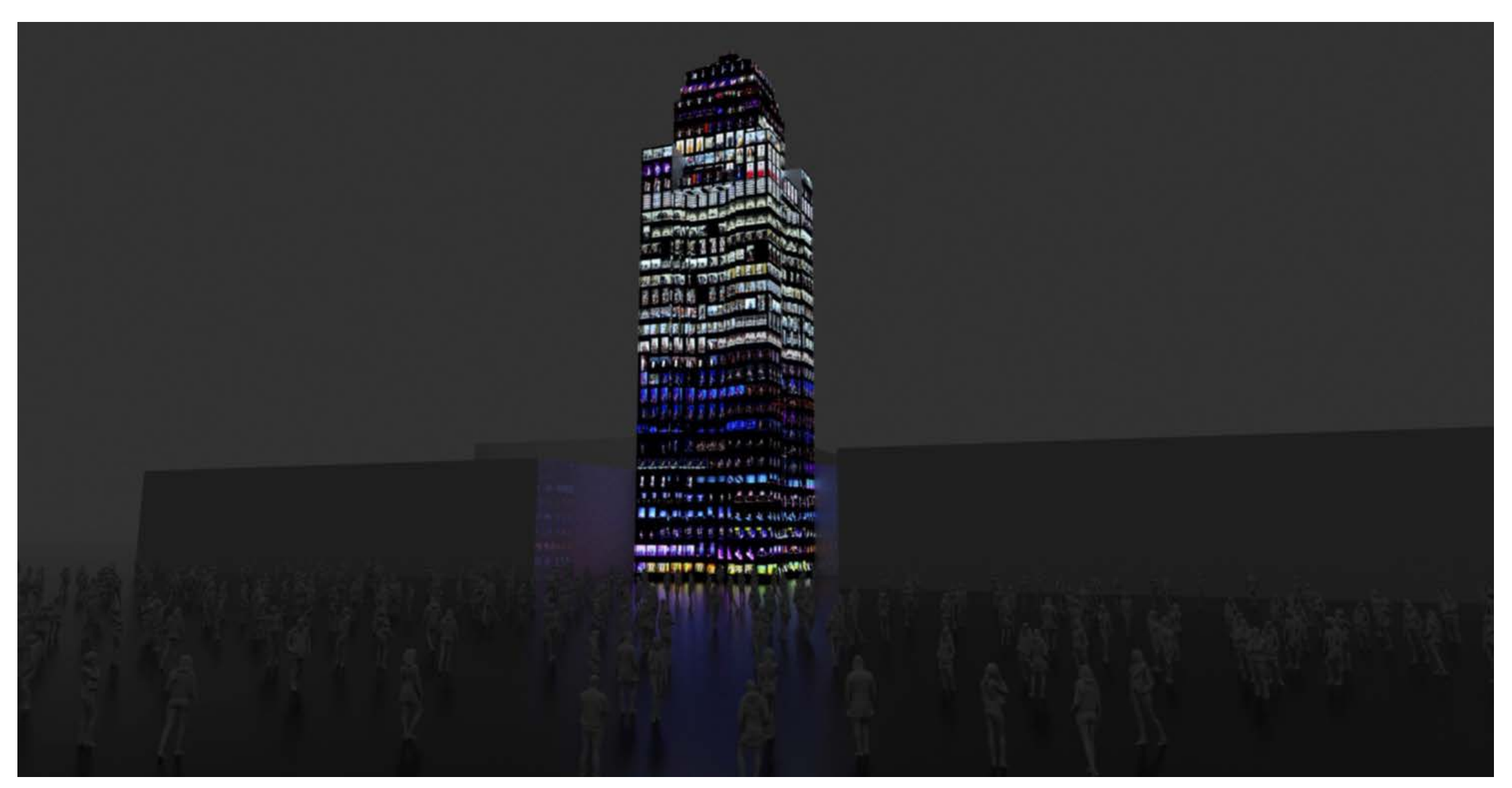
Chapter 1: Contact Sheet