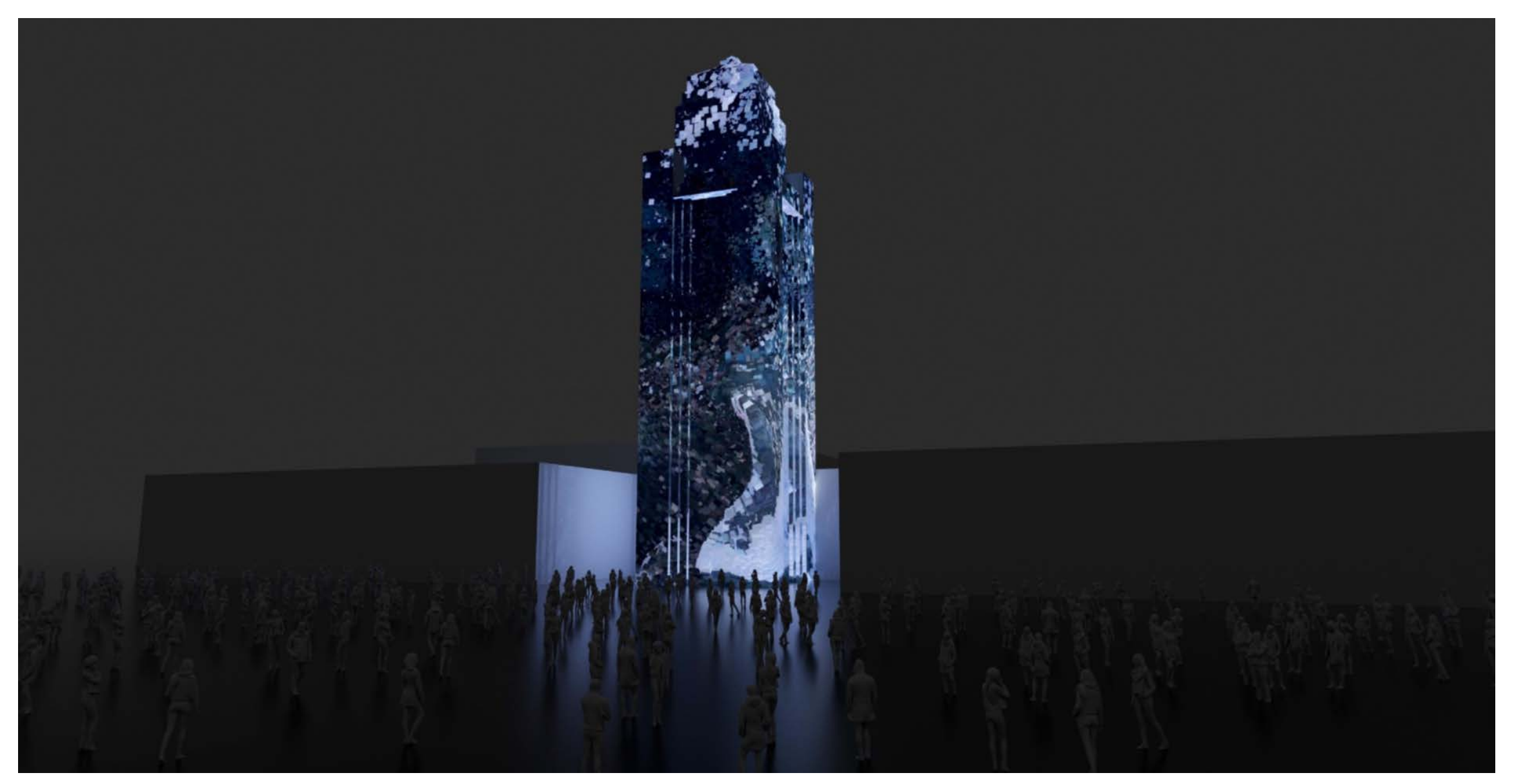
Chapter 4: Optical Flow