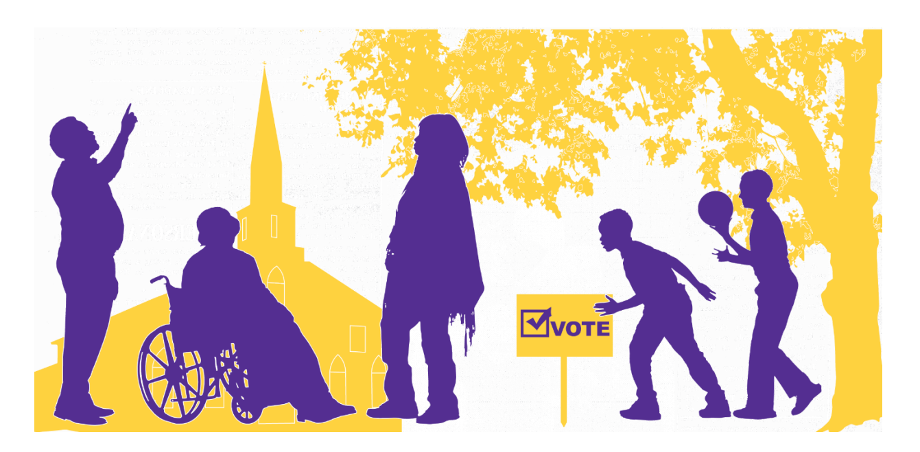
View from exterior

Section 3: One (1) bay totaling 7'8" in height x 16' in length x 9/16" in depth Four (4) laminated glass lites, each 7'8" in height x 4' in width x 9/16" in depth