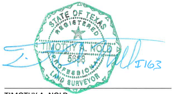
TIMOTHY A. NOLD REGISTERED PROFESSIONAL LAND SURVEYOR TEXAS REGISTRATION No. 5658

THENCE , SOUTH 00°29'01" EAST, WITH SAID WEST RIGHT-OF-WAY LINE, A DISTANCE OF 12.50 FEET TO THE POINT OF BEGINNING AND BEING A 0.0287 ACRE OR 1,250 SQUARE FOOT TRACT OF LAND, MORE OR LESS.