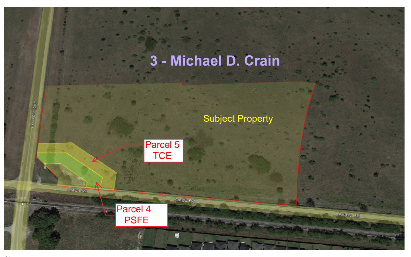
*LOCATION OF BOUNDARY IS APPROXIMATE.