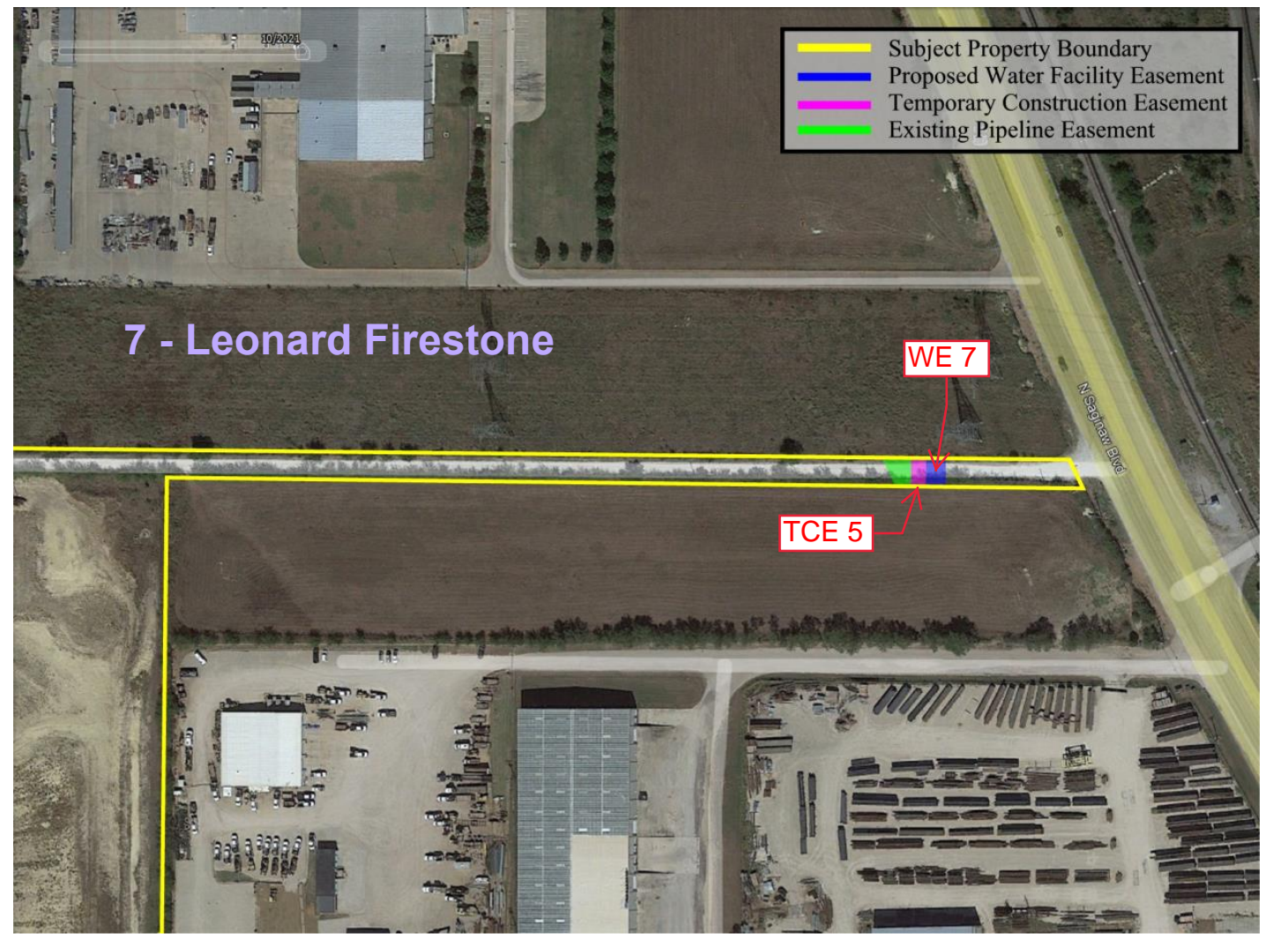
*The Yellow shaded area represents an out sale to Eagl Mountain-Saginaw ISD. *LOCATION OF BOUNDARY IS APPROXIMATE.