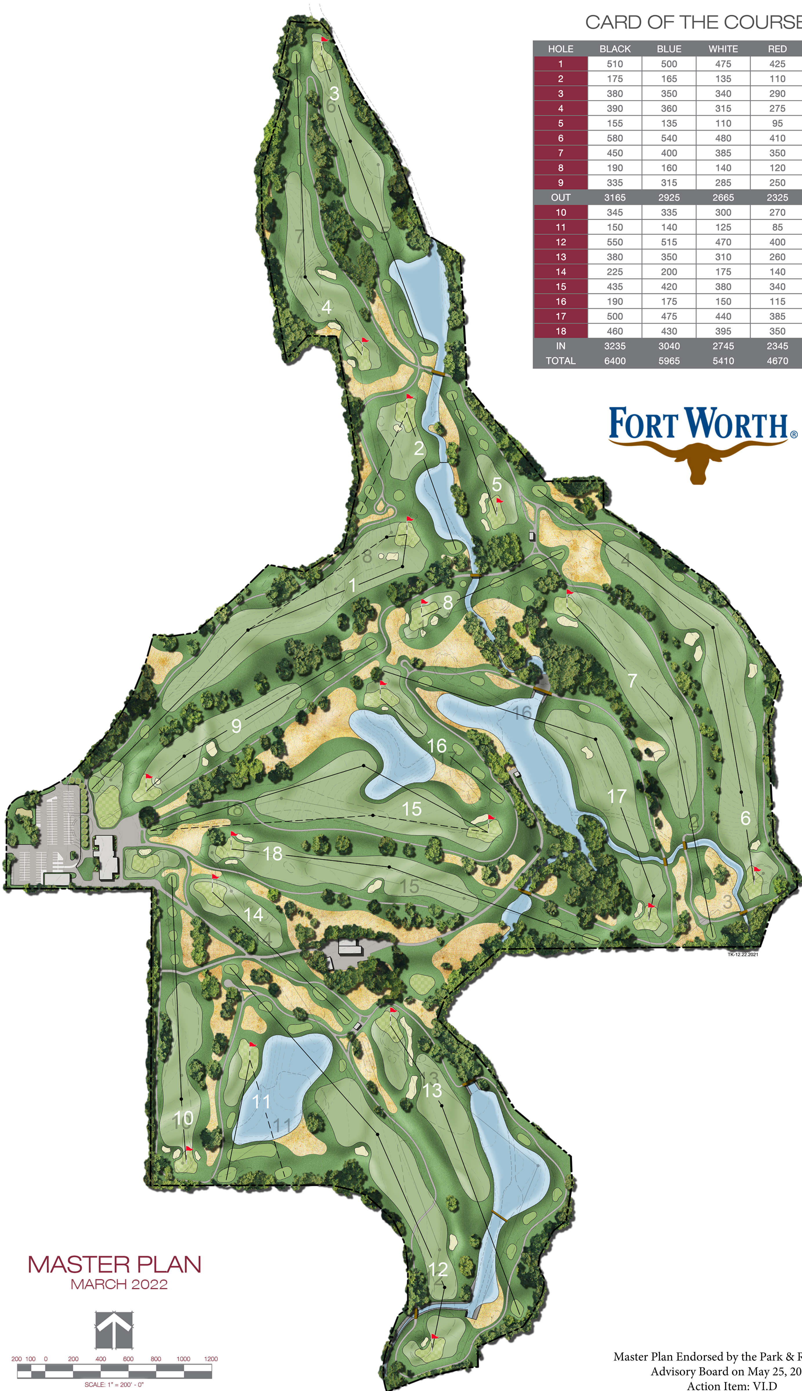
CARD OF THE COURSE