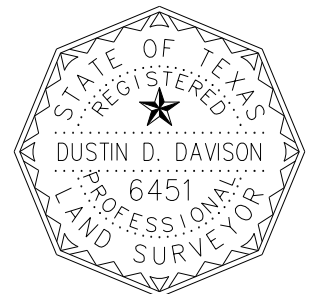
EXHIBIT "B" SHEET: 1 OF 1