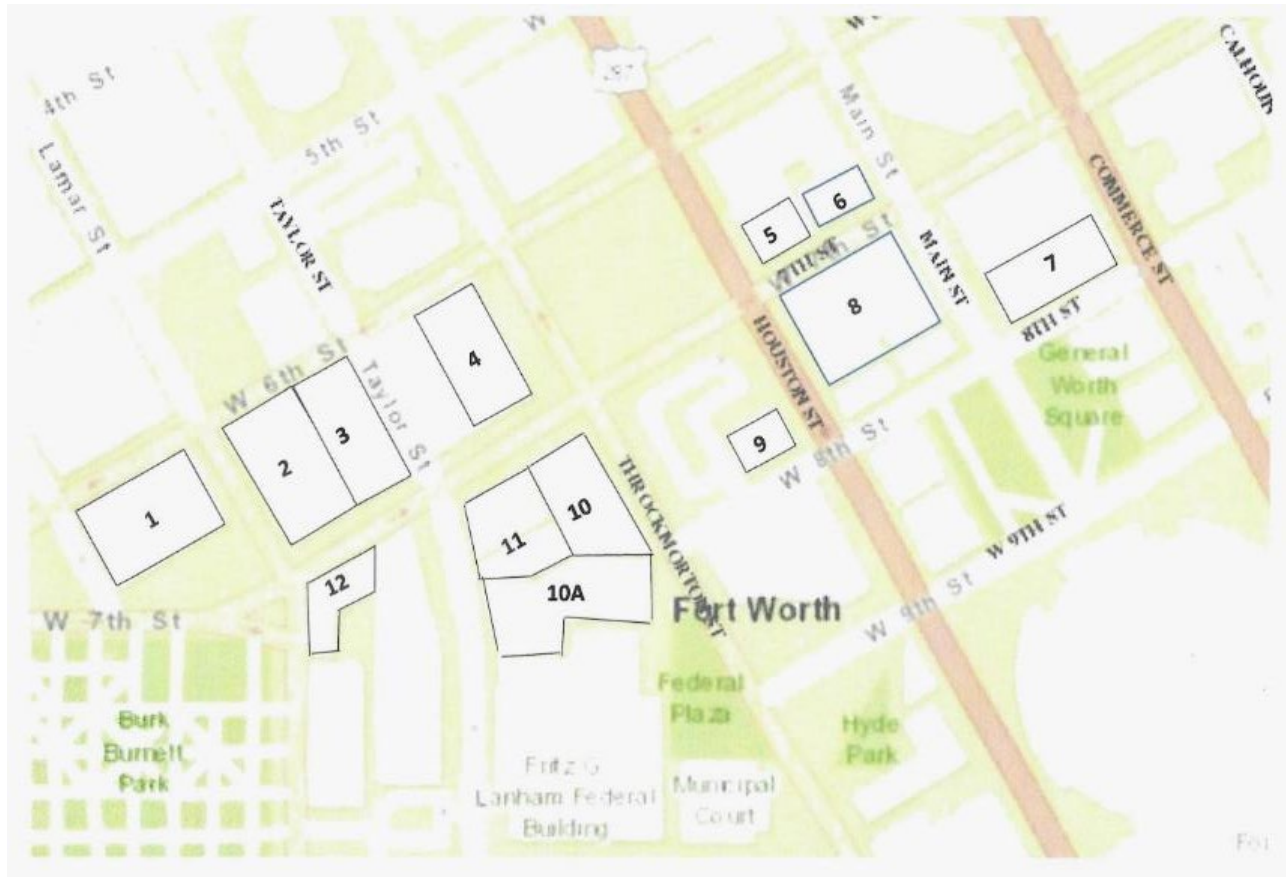
Fig. 3 –W. 7 th Street Corridor Historic Buildings