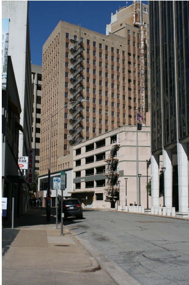
Fig. 7 – Oblique from South and West Elevations from Taylor Street.