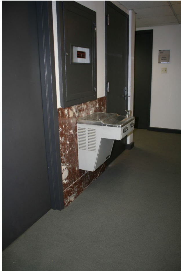
Fig. 11 – View of Original Wainscoting.