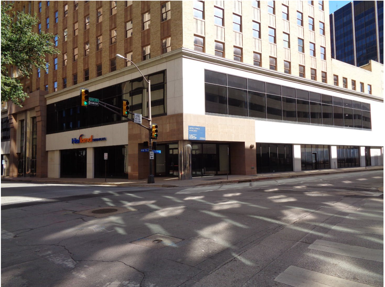
Fig. 8 – View of Base from the intersection of Taylor Street and W. 7 th Street.