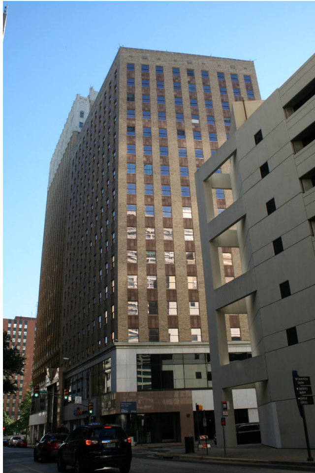
Fig. 6 – View of North and West Elevation from 7 th Street.