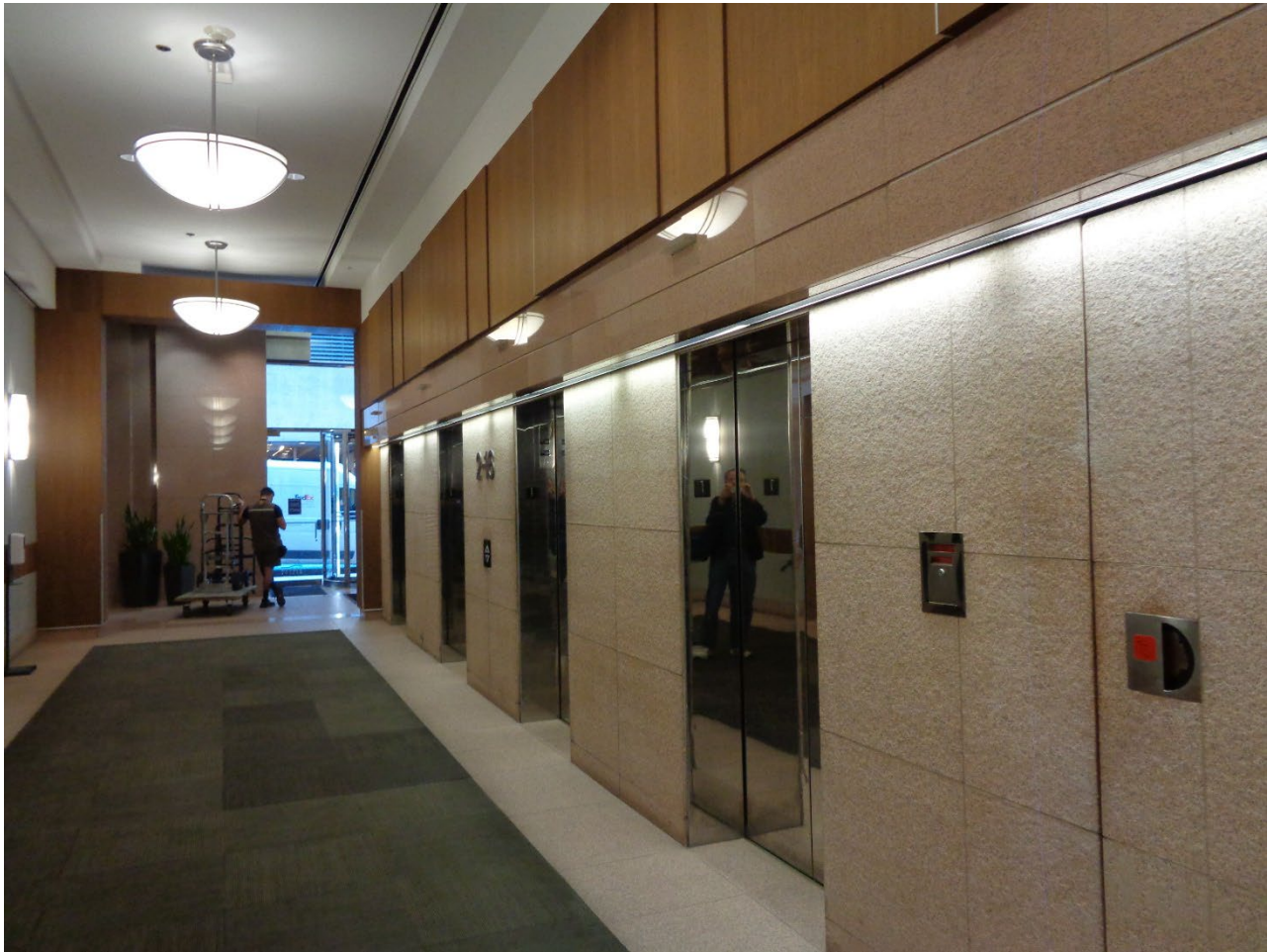
Fig 10. – View of First Floor Lobby (unoriginal) (Provided by Applicant).