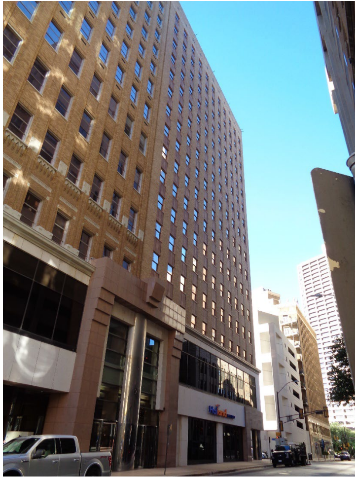
Fig. 5 –View of North Elevation from W. 7 th Street (Provided by Applicant).