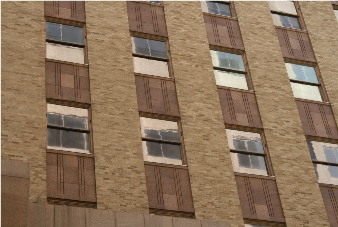
Fig. 9 – View of Original Metal Windows and Terracotta Spandrels.