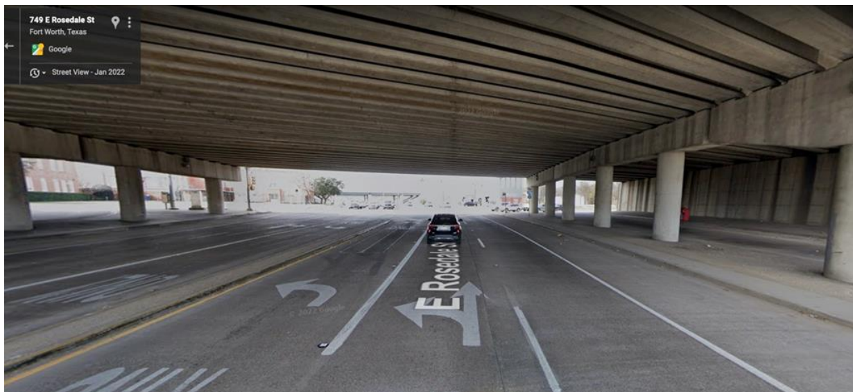
View of the East Rosedale Street at Interstate 35W Underpass looking east.