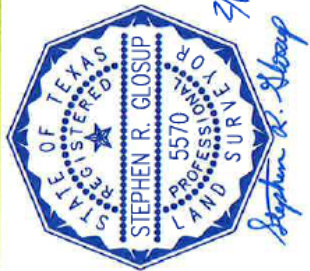
EXHIBIT "A" OVERALL ANNEXATION OF 115.026 ACRES OF LAND DENTON COUNTY, TEXAS