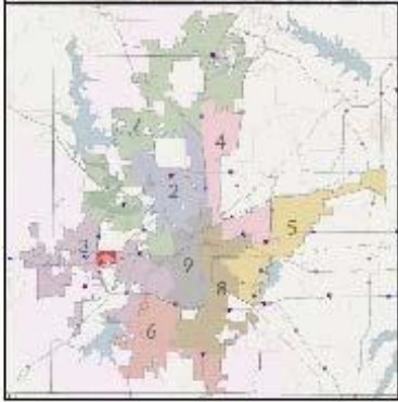
PID 1: Downtown