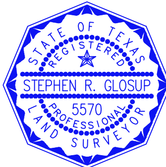
EXHIBIT "A" TEMPORARY CONSTRUCTION EASEMENT

550 Bailey Avenue • Suite 400 • Fort Worth, Texas 76107 Tel: 817.335.1121 TEXAS REGISTERED SURVEYING FIRM NO. 10098100