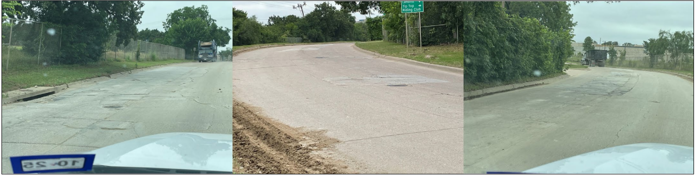
Figure 2: Photos of Deteriorating Panels of Salt Road

Figure 2 offers photographs of deteriorating panels along Salt Road, as examples.