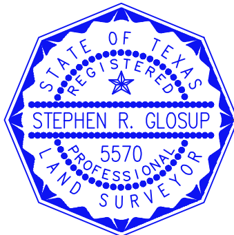
EXHIBIT "A" TEMPORARY CONSTRUCTION EASEMENT

A PART OF THE N. PROCTOR SURVEY, ABSTRACT NO. 1229