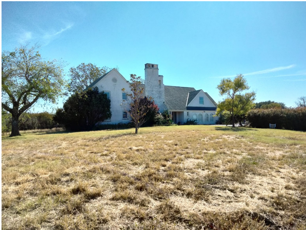
Fig. 4 – Showing primary structure. Note enclosed two-car garage on the right, Tudor-Revival style decorative brick chimneys and painted masonry.