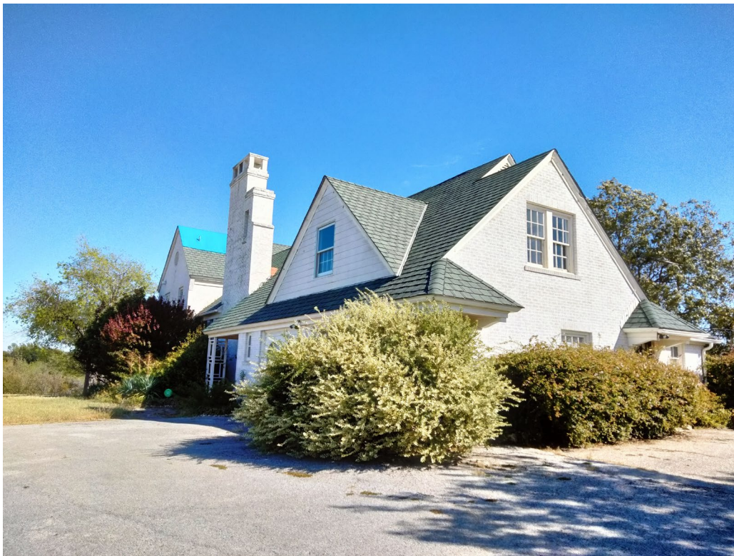
Fig. 7 – Showing the west elevat