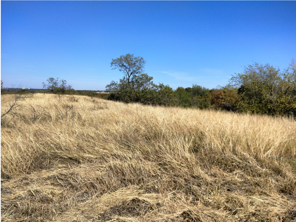
Fig. 10 – Showing Blackland Prairie and views to the east.