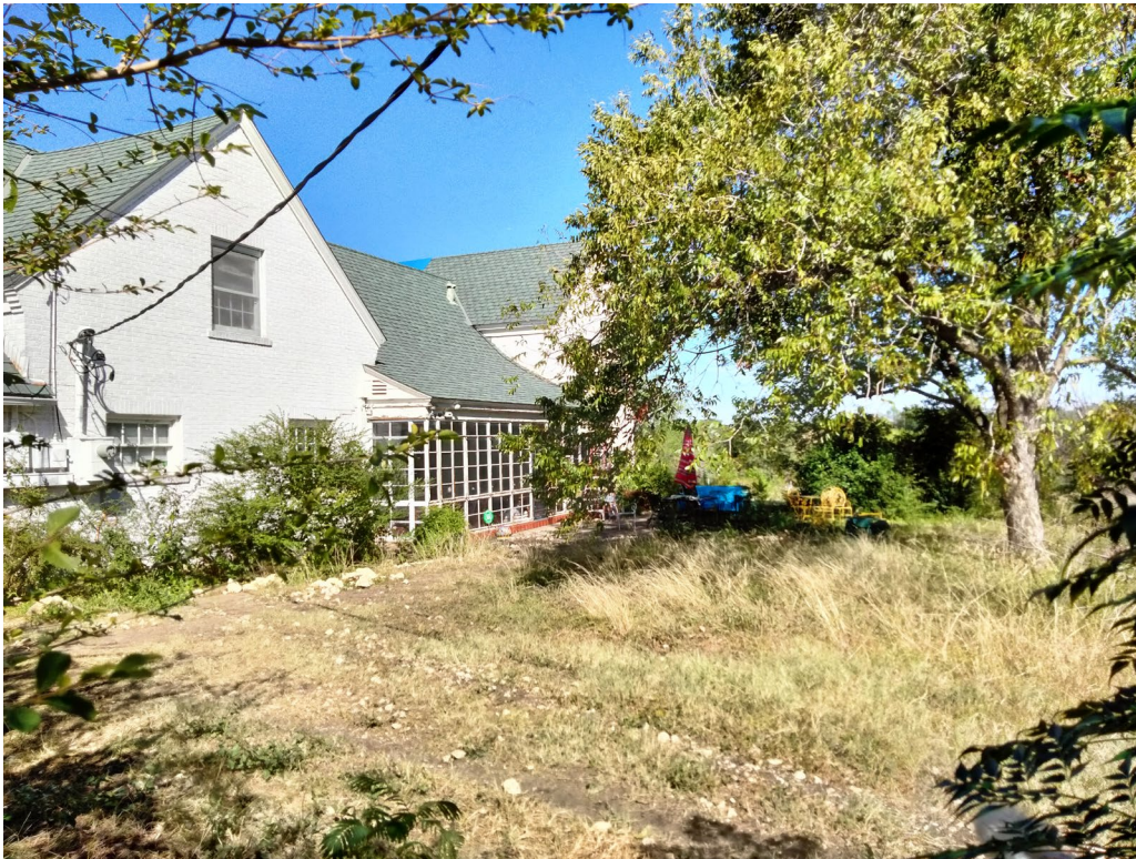
Fig. 8 – Showing the rear elevation and enclosed sunroom.