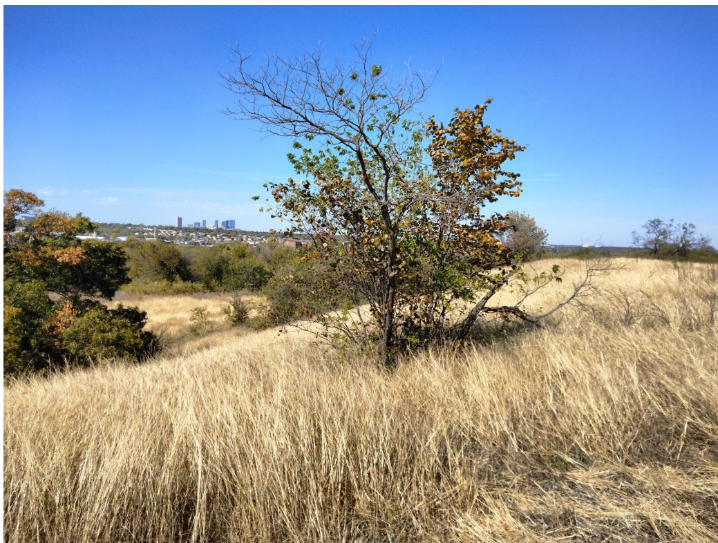
Fig. 9 – Showing surround Blackland Prairie and views of downtown Fort Worth. The high elevation and views of surrounding territory were important for the Caddo Native American tribe.