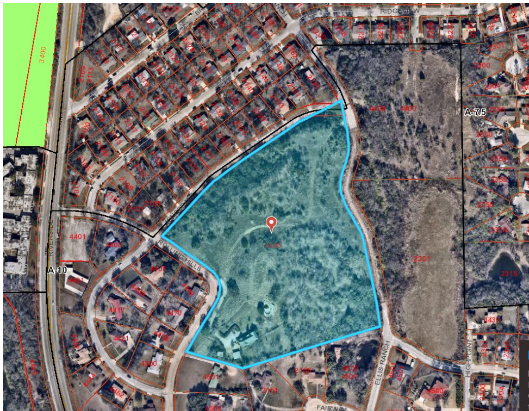
Fig. 2 – Showing the size of the parcel and untouched Blackland Prairie surrounding the primary residence.