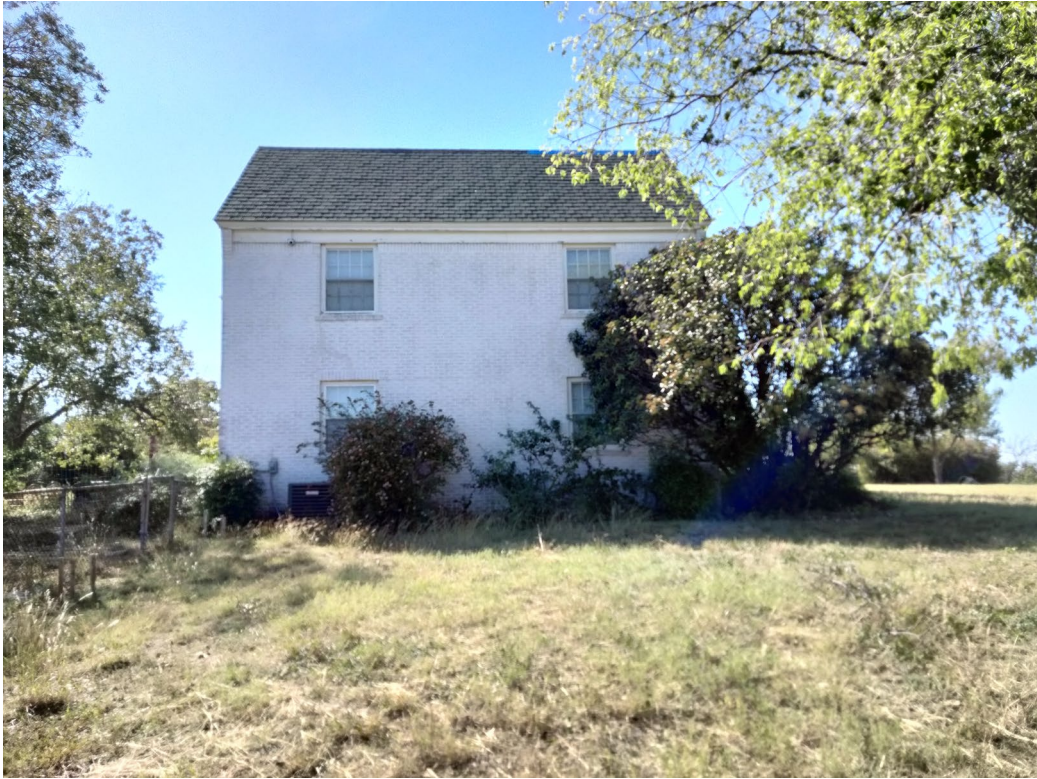
Fig. 6 – Showing east elevation. Note remaining 8/8 wood windows.