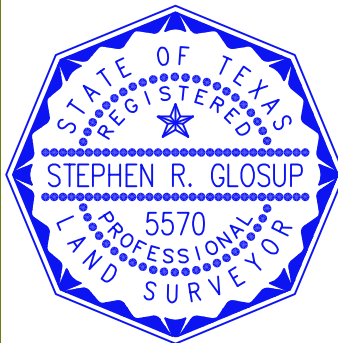
EXHIBIT "A" RIGHT-OF-WAY VACATION A PART OF DAGGETT'S ADDITION (UNRECORDED PLAT)

550 Bailey Avenue • Suite 400 • Fort Worth, Texas 76107 Tel: 817.335.1121 TEXAS REGISTERED SURVEYING FIRM NO. 10098100