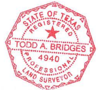
Exhibit "B" Street Right-of-way Vacation BEING A PORTION OF OLD ELIZABETHTOWN CEMETERY ROAD

SITUATED IN THE A. HENDERSON SURVEY, ABSTRACT NUMBER 596 CITY OF FORT WORTH, DENTON COUNTY, TEXAS.