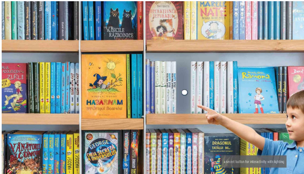
Buttons, which are battery operated and can be moved at library staff's discretion