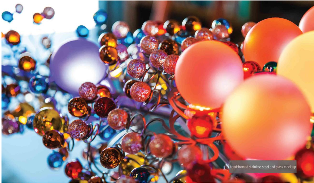
Mock-up of sculpture with proposed materials