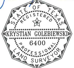
EXHIBIT MAP OF RIGHT-OF-WAY VACATION BEING A PORTION OF LIVE OAK, 2nd & 3rd STREETS IN THE MOORE THORNTON AND COMPANY ADDITION TO THE CITY OF FORT WORTH, TARRANT COUNTY, TEXAS

COPYRIGHTS: BRITTAIN & CRAWFORD LAND SURVEYING & TOPOGRAPHIC MAPPING FIRM CERTIFICATION# 1019000 TEL (817) 926-0211 - FAX (817) 926-9347 P.O. BOX 11374 * 3908 SOUTH FREEWAY FORT WORTH, TEXAS 76110 EMAIL: admin@brittain-crawford.com WEBSITE: www.brittain-crawford.com