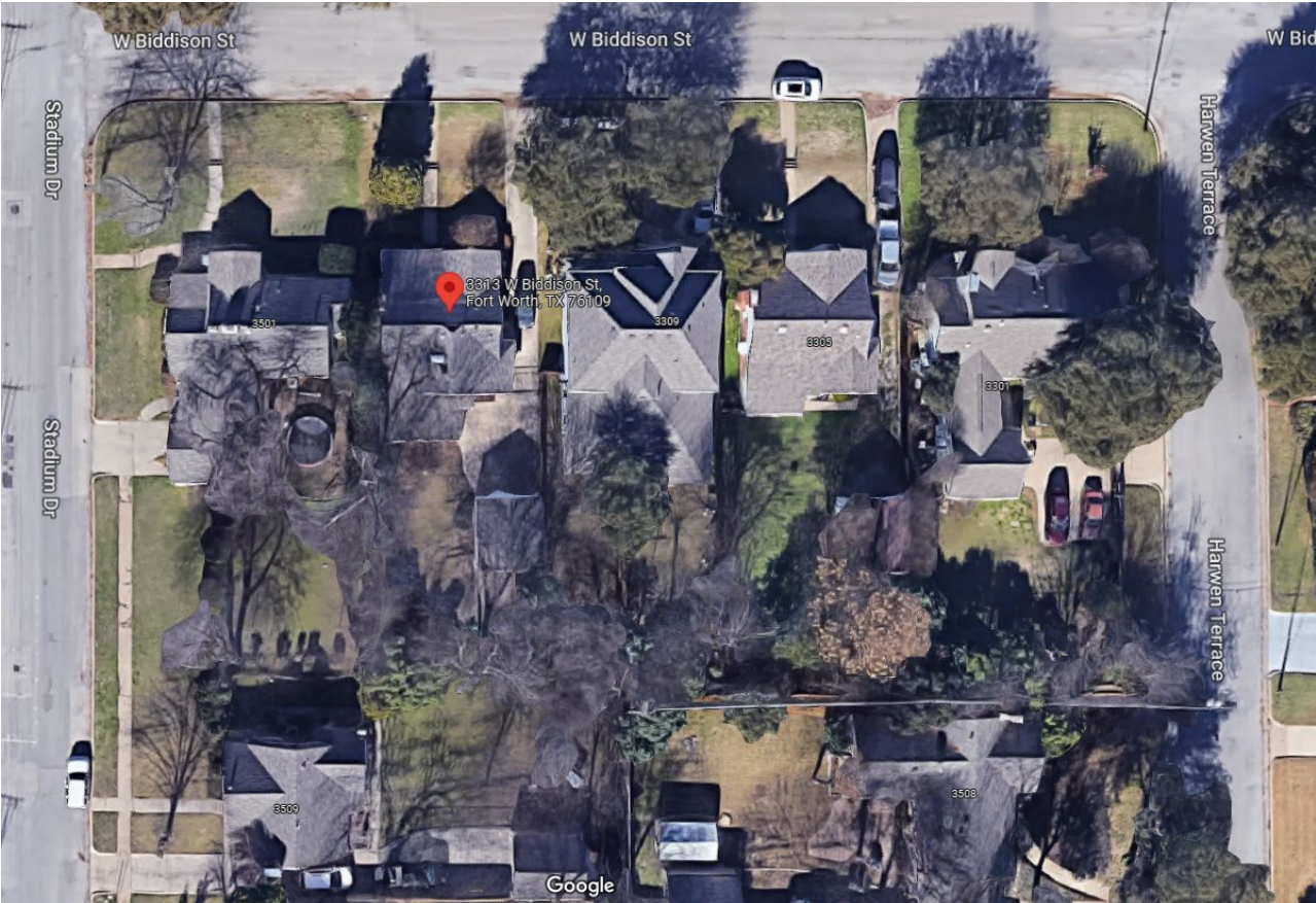
Fig. 2 - Aerial of property on block.