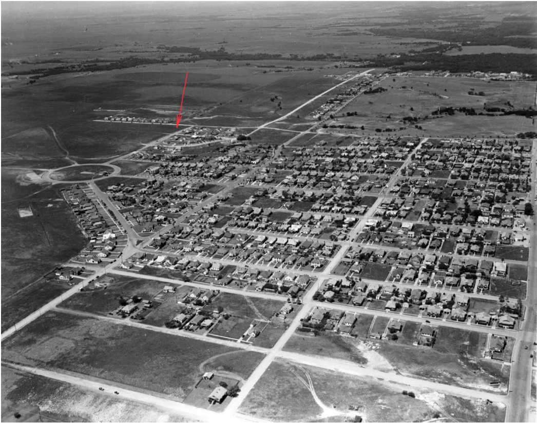
Fig. 10 - Circa 1939 aerial showing approximate location