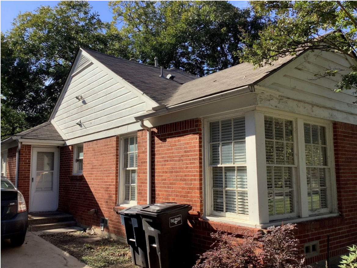
Fig. 6 – Showing west elevation. Note 6/6 wood windows.