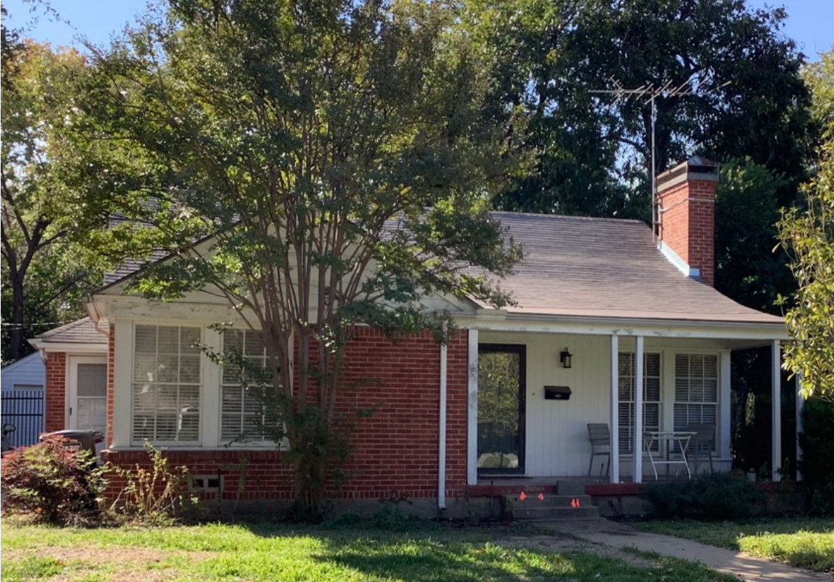
Fig. 4 – Showing primary structure. Note 6/6 windows.