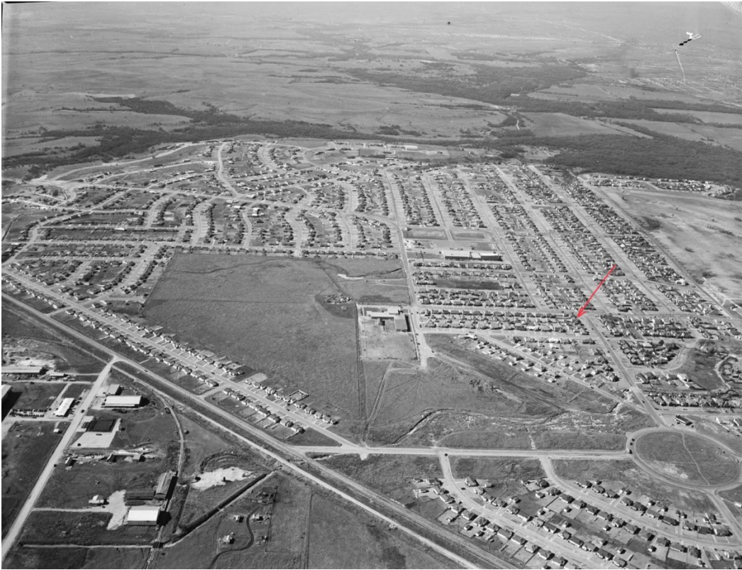
Fig. 11 - Circa 1950 aerial showing approximate location and development of surrounding aerial post-World War II.