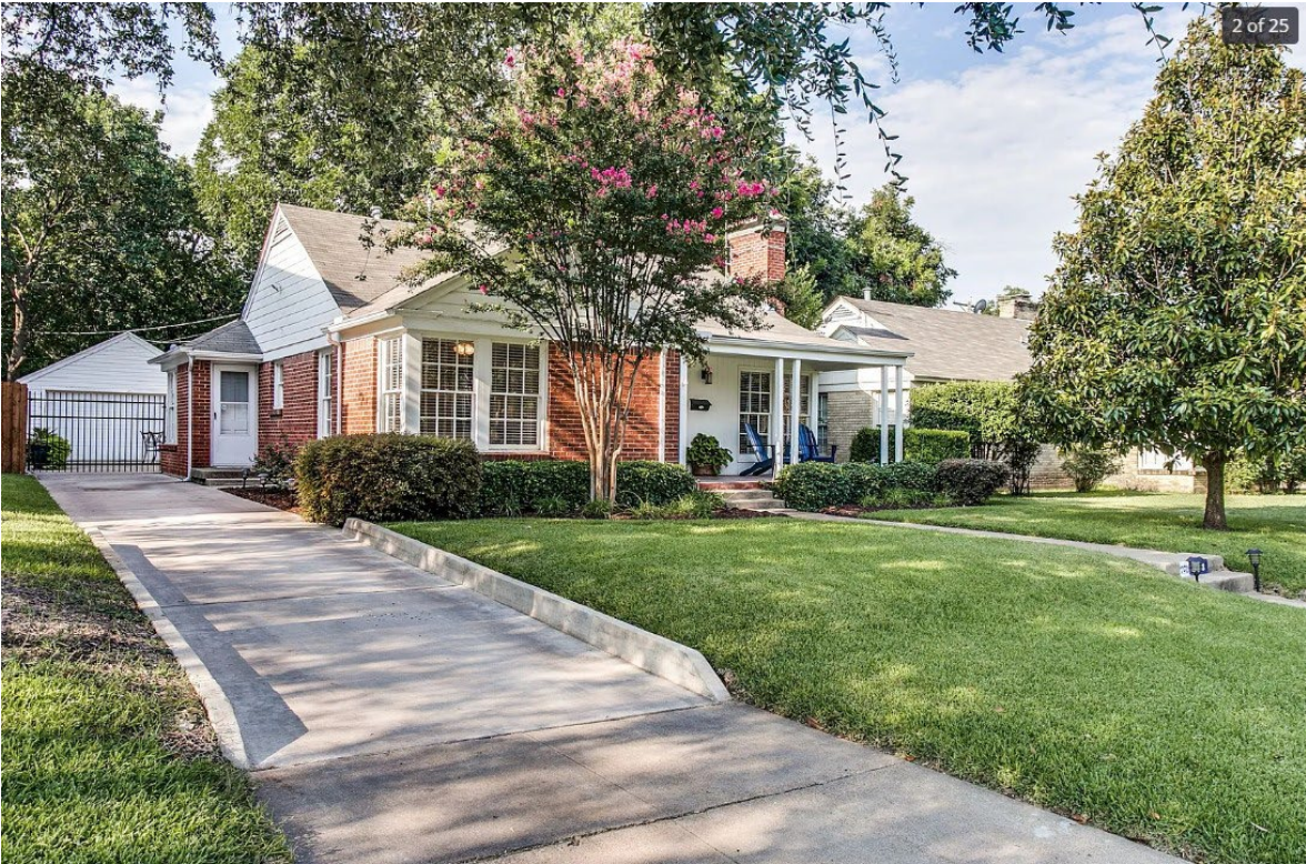
Fig. 5 - Showing primary structure and detached garage.