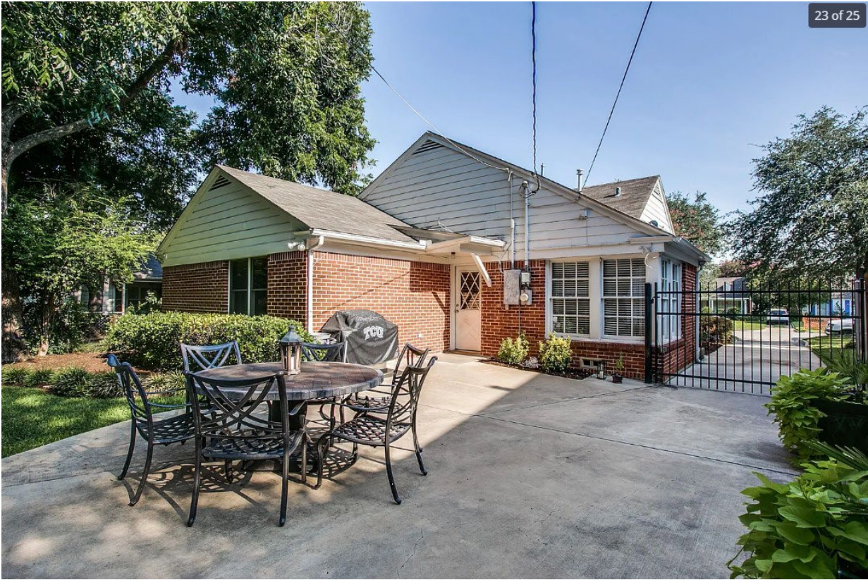
Fig. 7 – Showing the rear elevation.