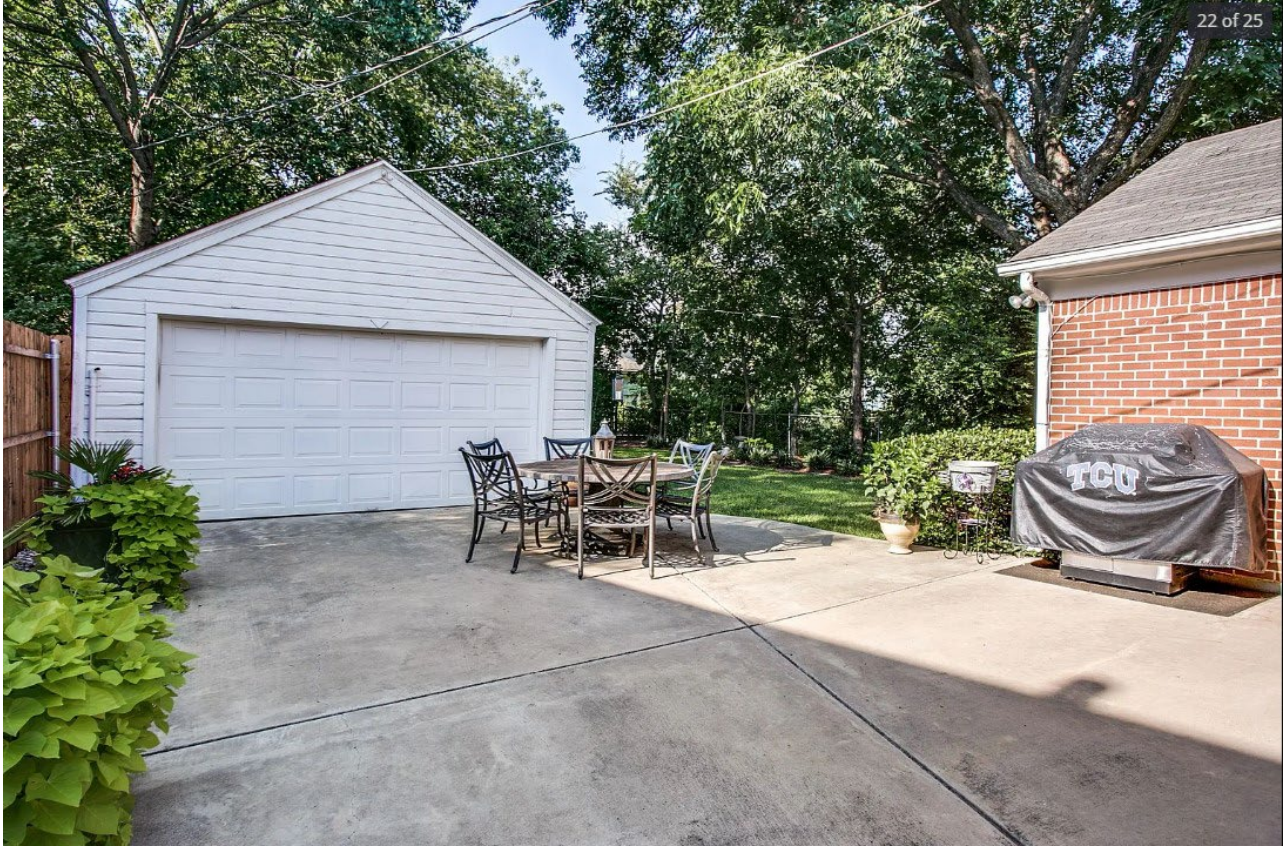
Fig. 8 – Showing detached garage.