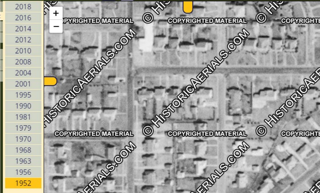
Fig. 3 – Showing location of subject property in 1952.