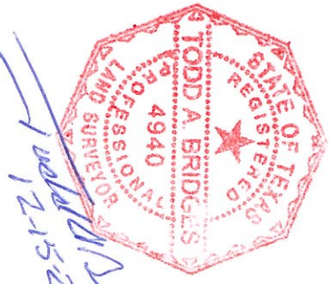
Exhibit of a